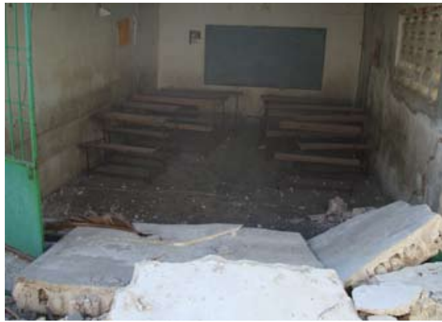
Clockwise top to bottom: earthquake survivors look at a woman killed by the falling rubble, HT’s 3 story residence destroyed by the earthquake, a HT seminarian pulled from the rubble of the collapsed residence, sisters helping earthquake victims during the night, an HT classroom destroyed by the earthquake.