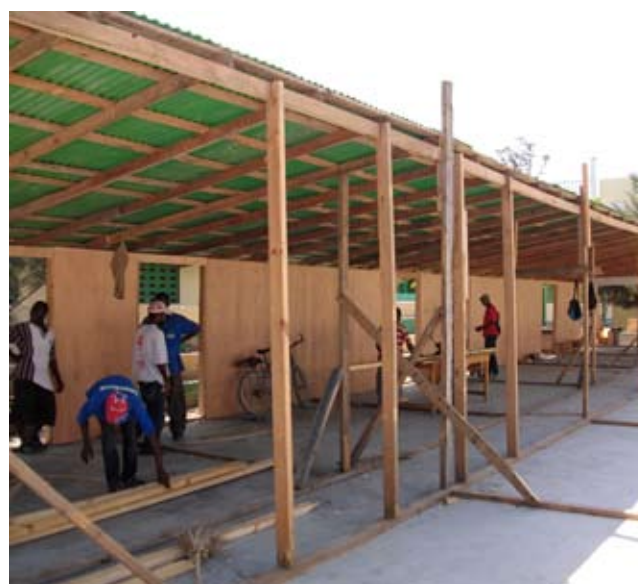
Top: Becky DeWine School children receive their daily meal, bottom: workers build temporary classrooms so that we can reopen school a few weeks after the earthquake destroyed 80% of our classrooms.